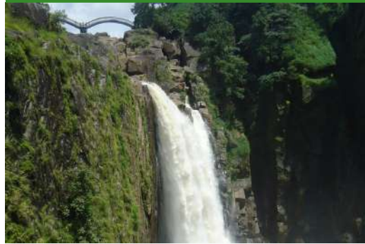
Cherrapunji, Meghalaya 793108