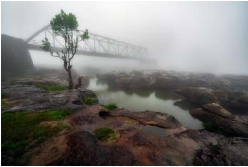
Dainthlen Road, Cherrapunji, Meghalaya 793111