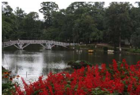
Khyndailad, Police Bazar, Shillong, Meghalaya 793001 Hours: Closes 5 pm