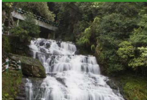
Upper Shillong, Shillong, Meghalaya 793009 Hours: Closes 5 pm