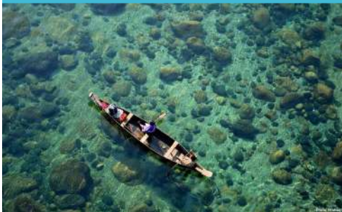
Activities at Dawki: Boating at Umngot river / Snorkeling/ Fishing/ Swimming/ Camping at Dawki or one