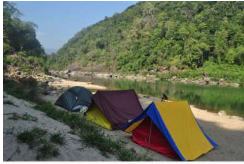
Dawki, Shnongpdeng, Meghalaya 793109