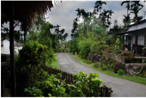
Located at Mawlynnong