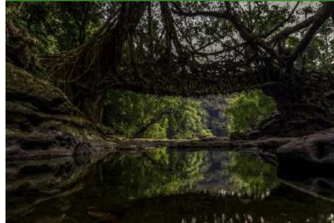
Located at Mawlynnong Nohwet Village