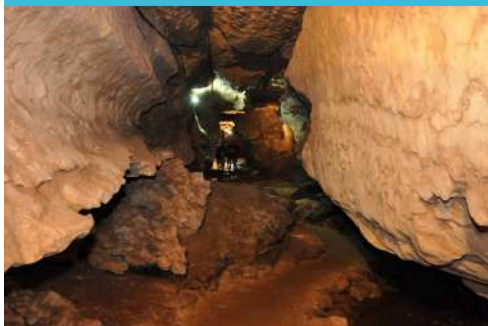
Cherrapunji, Meghalaya 793108; Hours: Closes 5:30 pm