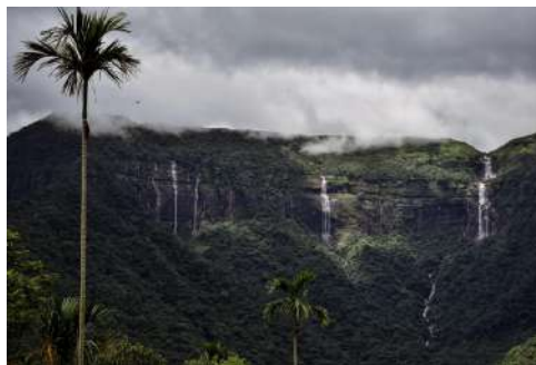
Spot 6 12.7 km from Garden of Cave